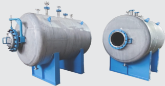
SS316/MS HORIZONTAL CAPSULE TANK