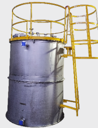
SS316/MS SOLVENT STORAGE TANK