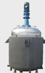
SS316/MS CHEMICAL REACTOR TANK