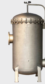
SS316/MS CHEMICAL FILTER HOUSING TANK