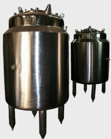
SS316 PRESSURE VESSEL TANK