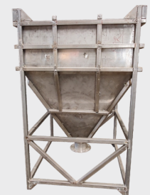
SS316 TOTE BIN