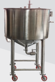
SS316 IPC LIQUID STORAGE TANK