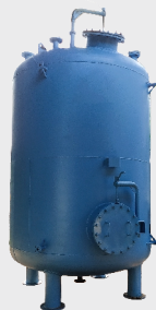
SS316/MS PRESSURE RELEASE TANK