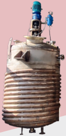
SS316/MS CHEMICAL REACTOR TANK