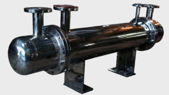
SS316/MS HEAT EXCHANGER