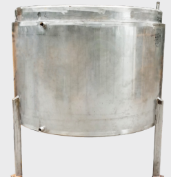
SS316 JACKETED STOCK HOUSING TANK